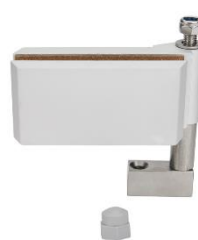
BOTTOM PIVOT WITH HINGE