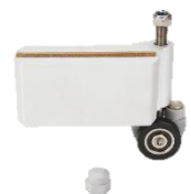
SINGLE HINGE ROLLER