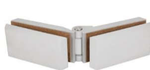
DOUBLE HINGE CENTRAL