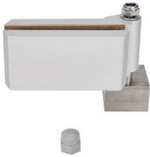
TOP PIVOT WITH HINGE