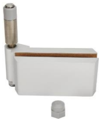
BOTTOM GUIDE WITH SINGLE HINGE

3.4.3.1 Use heavy-duty Hardware in all Glass Partitions. Approved type quality and brand.