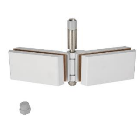
CENTRAL BOTTOM GUIDE DOUBLE HINGE