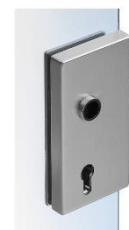
Glass Door Lockset