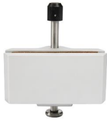
BOTTOM HINGE WITH BOLT