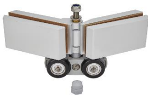
CENTRAL ROLLER DOUBLE HINGE