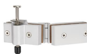
DOUBLE HINGE WITH BASE PIN