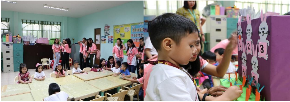
“Child Care Center Year-End Party”