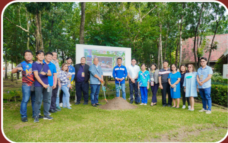
TSU Alumni Park soon to rise at Lucinda Campus