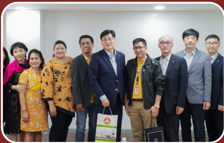
Daejin University of Korea meets with TSU officials for partnership